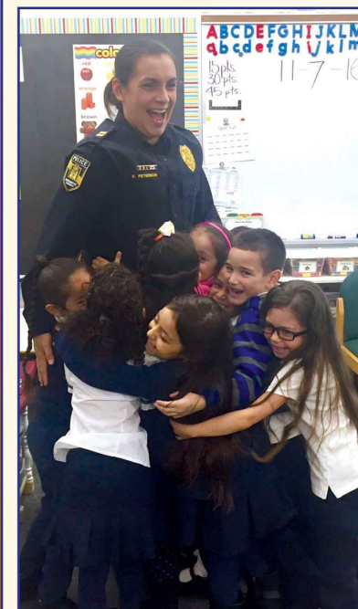
Local Police Officers stop by our preschool for hugs and reading.