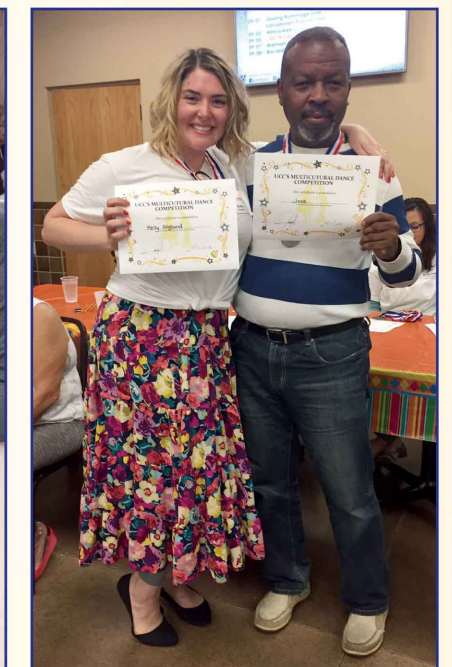
UCC Seniors are proud of their dance moves and dance partners at Michael Best & Friedrich LLP.