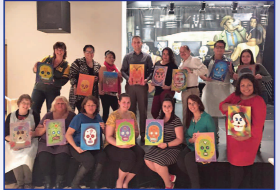
Almost 20 budding artists enjoyed painting their Dia de Los Muertos artwork at the first Pinto con Tinto.

We are excited to continue to engage the community with our unique Latino Arts programming. Check out our website for all of the details: www.latinoartsinc.org