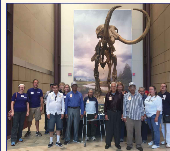
Our seniors explore the Milwaukee Public Museum with friends at US Bank.